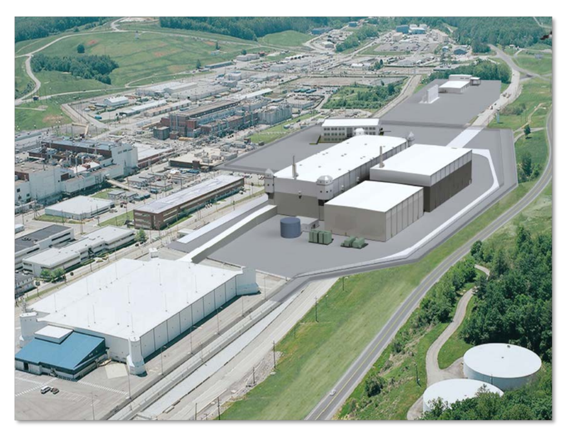
Figure 4. Y-12 Future State