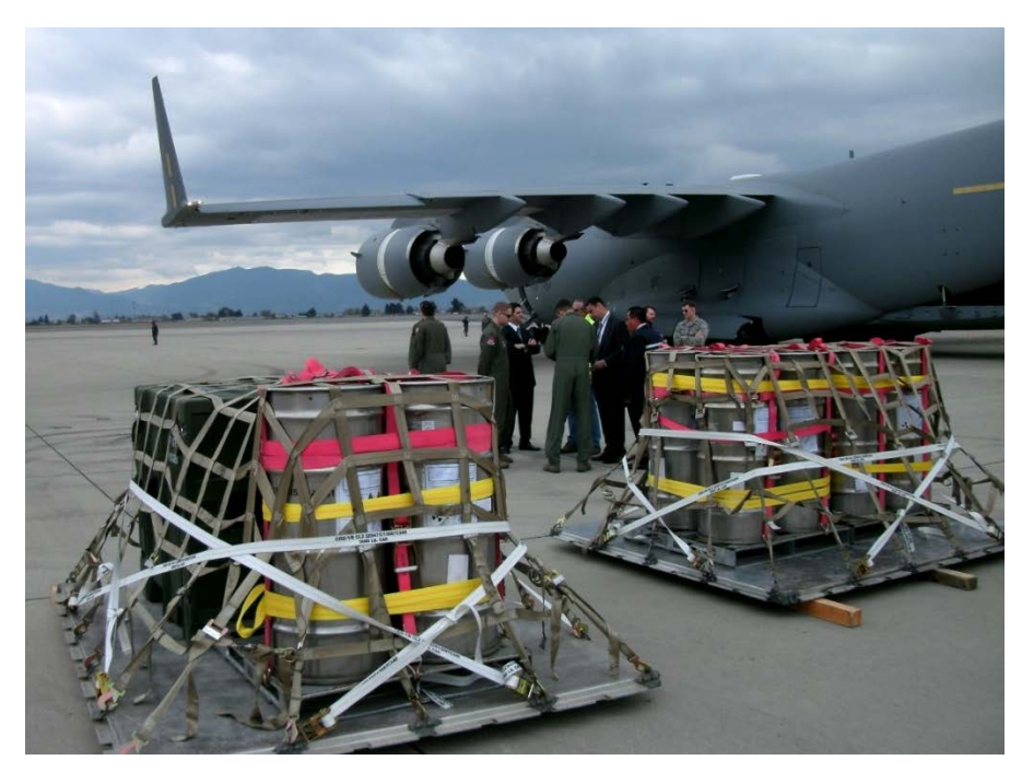
Figure 1. Material for Return in Mexico

We secure and recover nuclear materials wherever they exist. Since 1994, Y-12 has led numerous material recovery missions worldwide, most recently in Canada and Japan. In most cases, highly enriched uranium from these and other countries is brought back to Y-12, where we safely and securely store it until it can be dispositioned for peaceful uses. Figure 2 depicts the areas where material around the globe has been recovered.