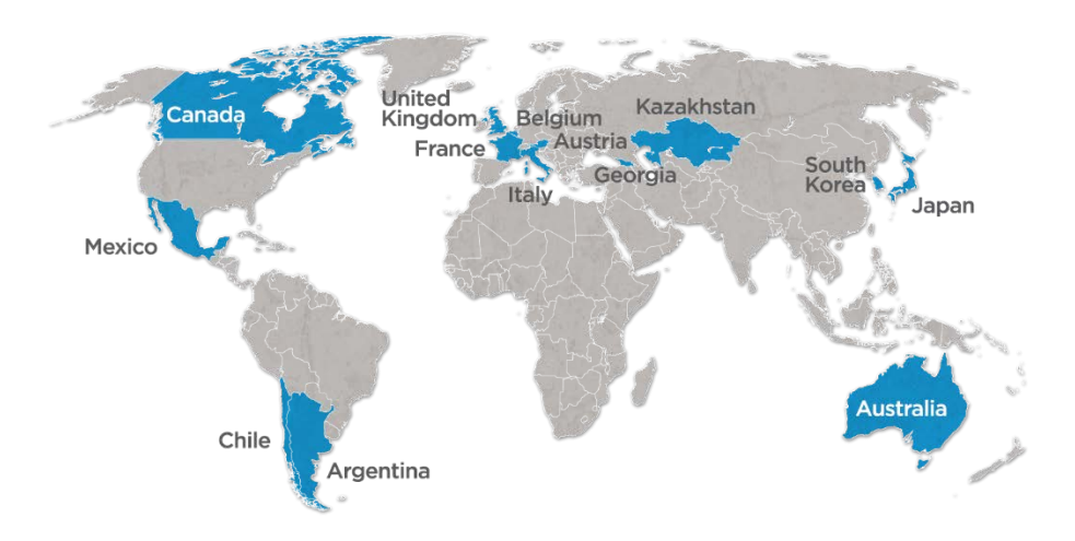
Figure 2. Global Return Map

We secure and recover nuclear materials wherever they exist. Since 1994, Y-12 has led numerous material recovery missions worldwide, most recently in Canada and Japan. In most cases, highly enriched uranium from these and other countries is brought back to Y-12, where we safely and securely store it until it can be dispositioned for peaceful uses. Figure 2 depicts the areas where material around the globe has been recovered.